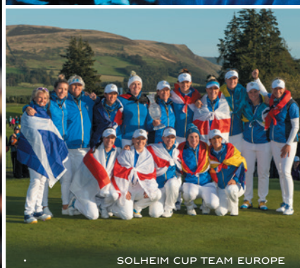
SOLHEIM CUP TEAM EUROPE