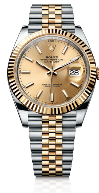
OYSTER PERPETUAL DATEJUST 41